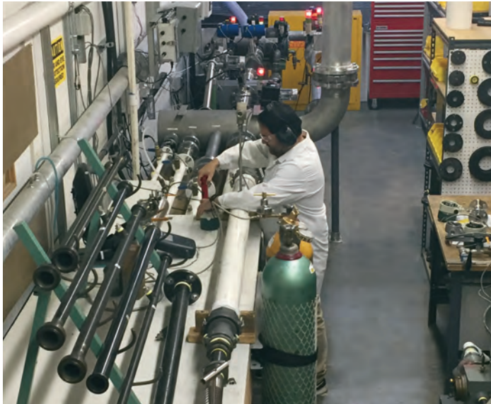
Automated NIST Traceable Calibration System

Provides accuracy of +/- 0.5% of Full Scale +/-1% of Reading over 100 to 1 turndown