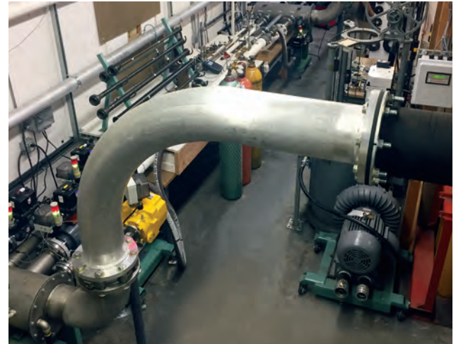
Main Intake to High Velocity Facility