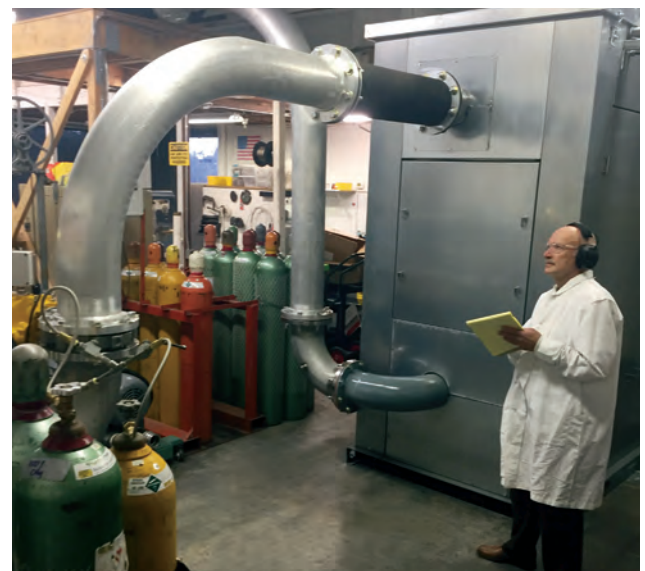
High Velocity Flow Facility